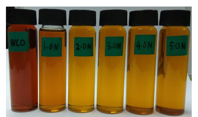
Fig. 3. Colour of the WCO and neutralized WCO samples (normality of caustic soda: 1.0, 2.0, 3.0, 4.0, and 5.0 N)

Figure 3 shows the colour of the WCO and neutralized WCO samples. It can be observed that the WCO sample was dark brown whereas the neutralized WCO samples were clear yellowish, regardless of the normality of the caustic soda. The dark colour of the WCO sample is indeed expected because of the by-products present in the sample as a result of repeated frying and oxidation processes, which produce free fatty acids, among other by-products. Thus, the WCO becomes clearer by neutralizing the free fatty acids in the oil with caustic soda, as evidenced from the results.