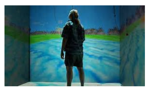
Fig. 1. Fully immersive VR environments