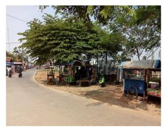
Fig. 4. Small Traders

Based on the information from the caretaker (juru kunci) of TKP, the traders are indigenous people who live around TKP and do not have permanent jobs. Usually, holidays or at certain times, there will be a small crowd of traders around the area. There is no community that abbles in other businesses other than trading and there were only janitors who were paid by the local government for jobs like sweeping the streets, cutting grass, and repainting the colours of the wall or rebuilding fences around TB and TKP.