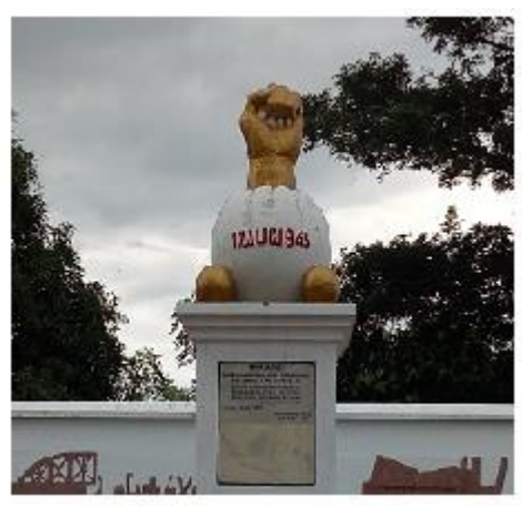
Fig. 3. Tugu Kebulatan Proklamasi (TKP)

Initial observations in February and March 2018 conducted for this research showed that the, number of small traders grew surrounding TKP. For instance, they occupied half on the side of Tugu Bojong (TB) precisely, signifying that many people can use the opportunities to dabble in small businesses. The condition was very different when researchers conducted a similar research at the same place in mid-2017.